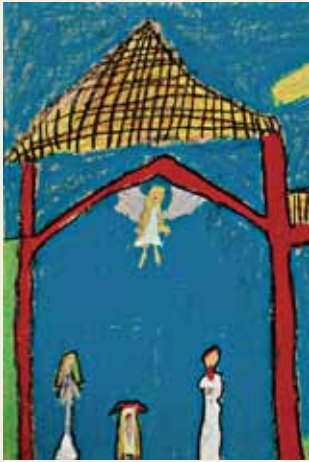
Cover Artwork- detail by Katie Crotwell