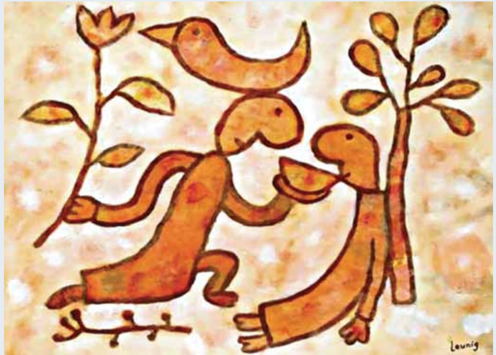
Art by Michael Leunig